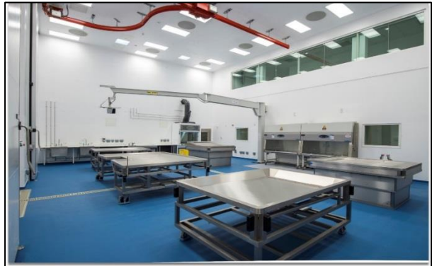
Surrey Veterinary Pathology Centre (left) and the main post-mortem room (right)